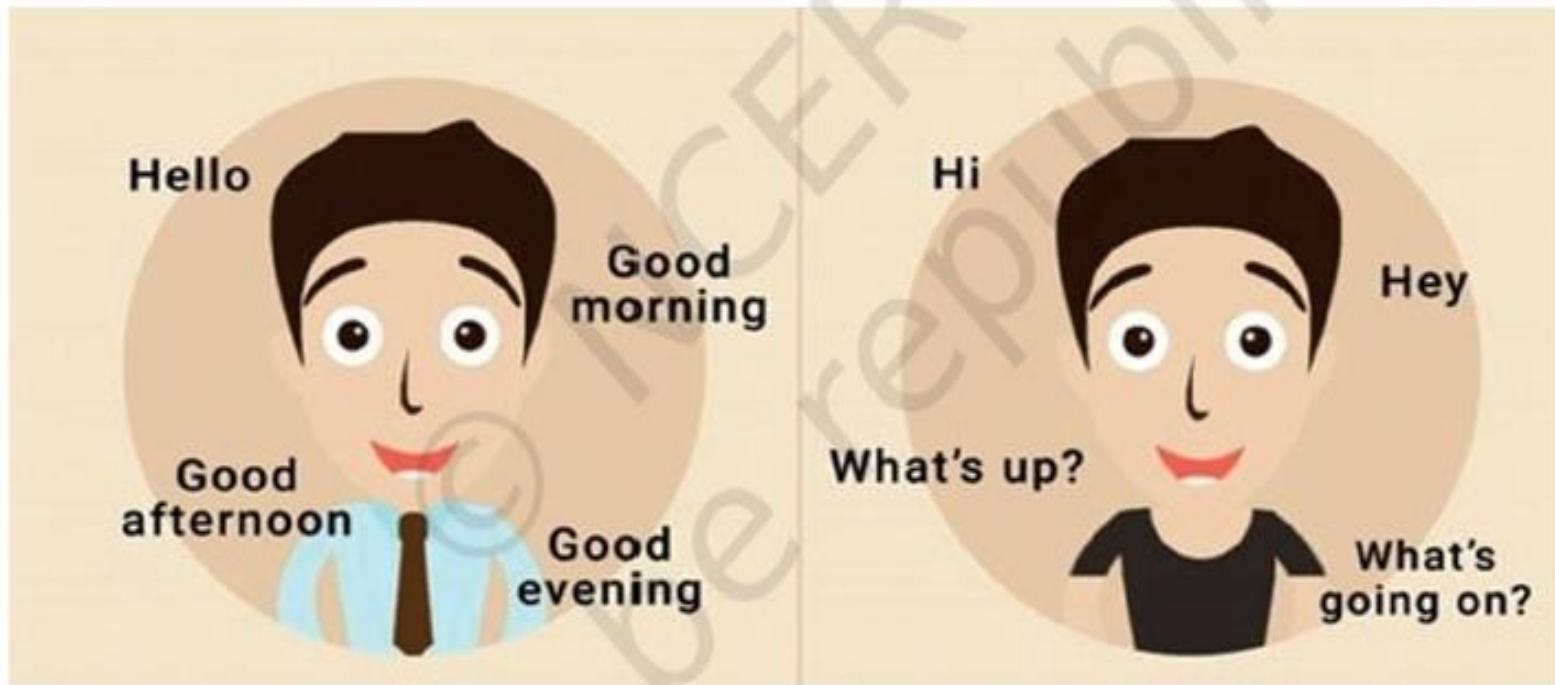
Formal and Informal Greetings